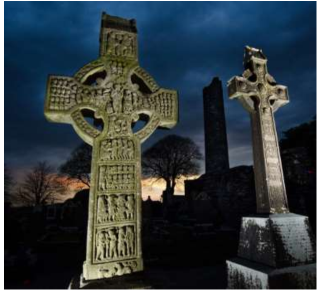
Muiredach's High Cross- Monasterboice